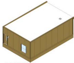
2 BUILDING ISOMETRIC VIEW