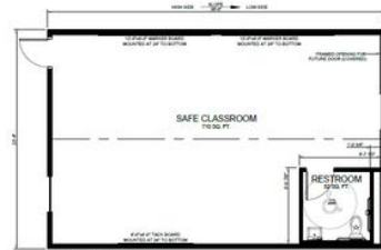
1 FLOOR PLAN